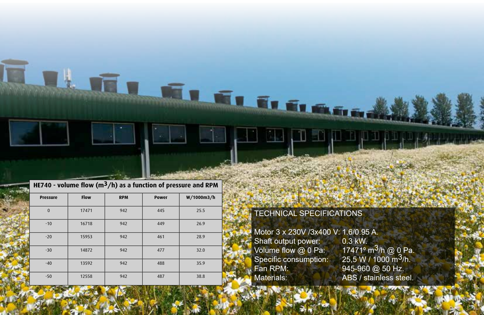
HE740 - volume flow (m 3 /h) as a function of pressure and RPM

Due to the durable construction the HE740 with turning baffle can be installed in, for example, wall constructions.